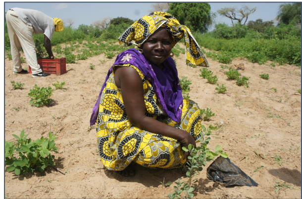
Participant farmer planting shrubs in her plots.

Although OSS has shown profound results on long-term research plots, these projects are the first time the OSS is being piloted under farmer-managed conditions. Thirty farming households in Senegal have established twoside-byside comparison plots, one with OSS and one with the traditional management system of removing and burning the shrubs.